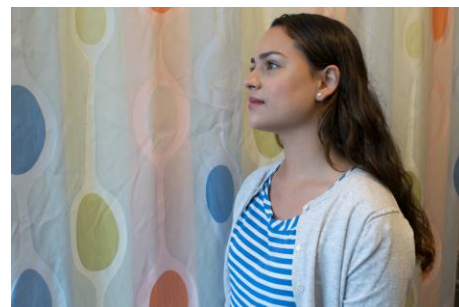
6 Take the inhaler out of your mouth and hold your breath for 10 seconds.