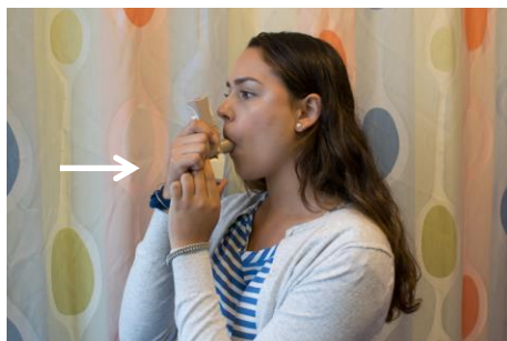
5 Put the inhaler in your mouth and close your lips around the mouthpiece. Take a deep breath in.