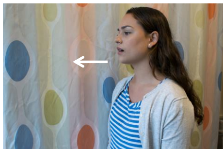
4 Turn your head away from the inhaler and exhale (breathe out) all the way.