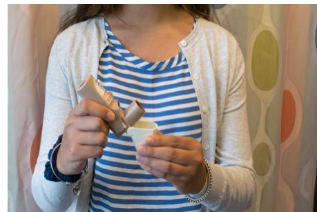
3 Open the cap.