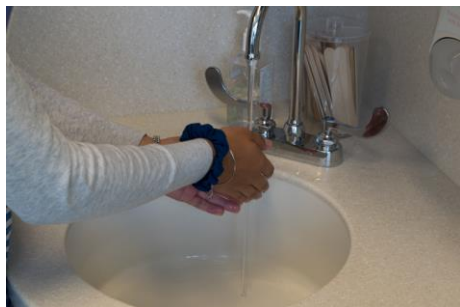
1 Wash your hands.

Your health care provider has prescribed medication that is given using the QVAR ReditHaler. This medication is given in two strengths: 40 mcg (tan) and 80 mcg (red). Which dose do you have?