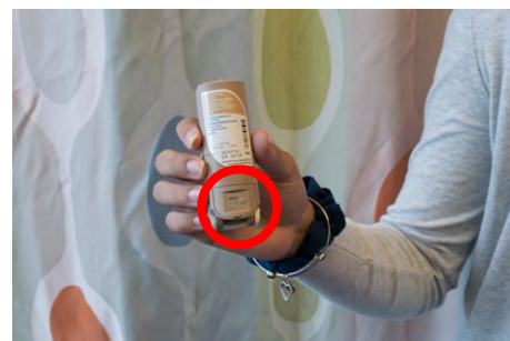
9 Check the back of the inhaler to see how many doses are left. The numbers will turn red when you have 20 doses left. That means it is time to refill your medication.

Note: Clean the mouthpiece with a dry cloth only. Do not get this inhaler wet with water.