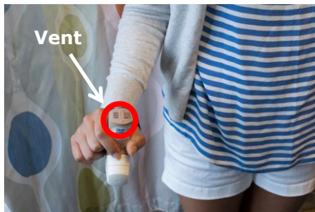
2 Hold the inhaler upright. The cap should be at the bottom. Do not cover the vent at the top.