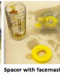
Spacer with facemask