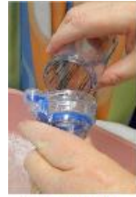
Spacer with mouthpiece