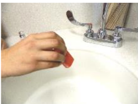
7. Shake off any water on the inhaler cover.