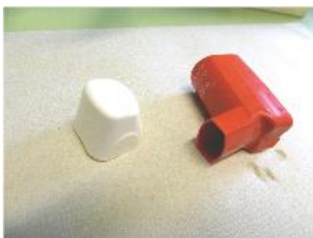
8. Place the cleaned parts of the inhaler on a paper towel and let air dry.