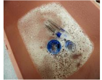
4. Soak the spacer parts in mild, soapy water for 15 minutes.