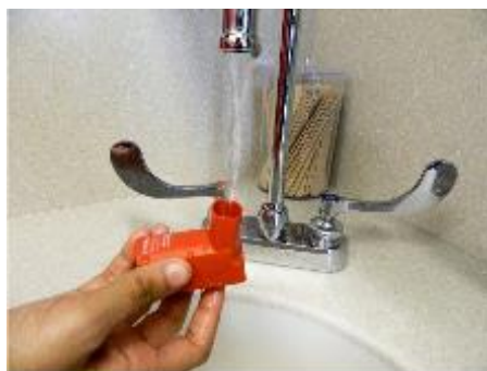
5. Turn the inhaler cover upside down and run the bottom under the warm water for 30 seconds.