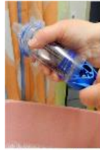
Spacer with mouthpiece