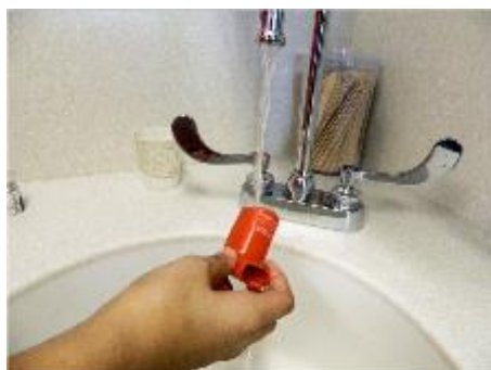
4. Hold the top of the inhaler cover under warm water for 30 seconds.