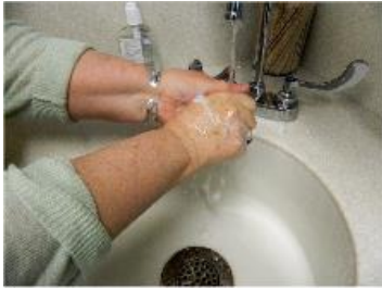
1. Wash your hands.

Follow the steps below to clean your spacer.