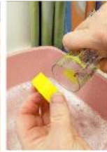
Spacer with face mask