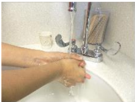
1. Wash your hands.

Follow the steps below to clean your inhaler.