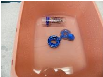
5. Rinse the spacer parts in clean water.