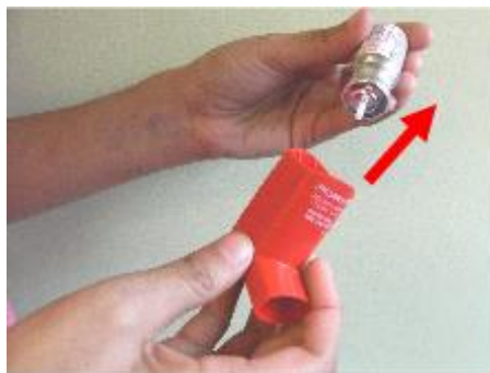
2. Take the canister out of the plastic inhaler cover.