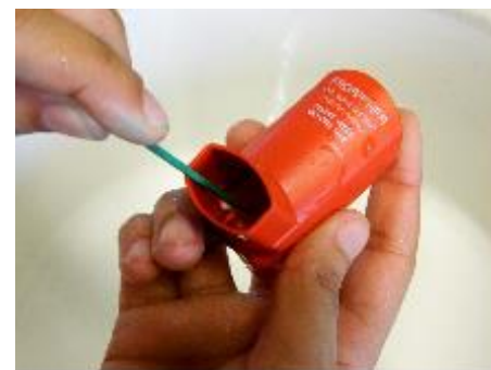
6. If needed, use a toothpick to scratch off any hardened medicine from the small hole in the inhaler cover.