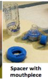
Spacer with mouthpiece