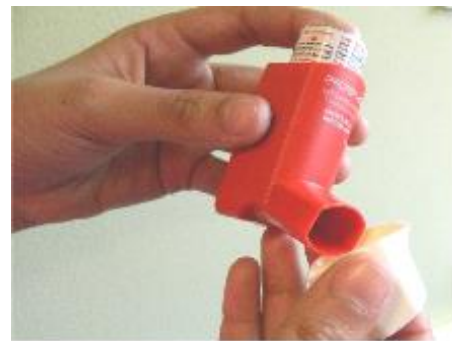
3. Take the cap off of the inhaler.