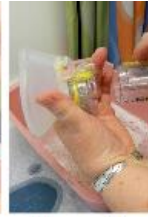
Spacer with face mask