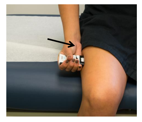
4 Press firmly until you hear a "click" and "hiss" sound. Hold in place for 2 seconds.