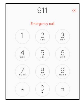
5 Call 911.